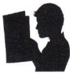
1 READING A BOOK