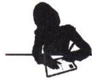
3 WRITING A POSTCARD