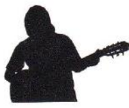
6 PLAYING THE GUITAR