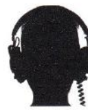
7 LISTENING TO MUSIC