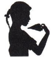
4 EATING A PIZZA