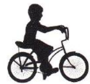
8 RIDING A BIKE